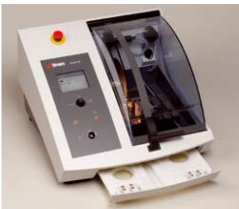
Recirculation tank with capacity for 4.75 litre cooling fluid