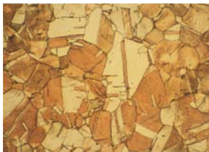
Pure copper. Sample etched with cupric chloride and ammonia. Magnification 100 x