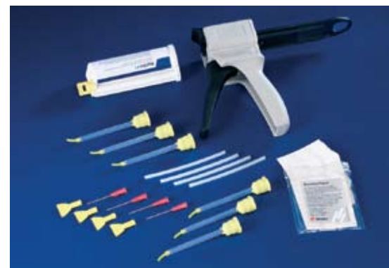
RepliSet 50 ml system.