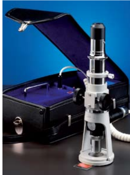
PSM-2 and Transcopy constitute an indispensable tool for non-destructive materialography.

Movipol-3 is equipped with rechargeable batteries and supply transformer. In other words, the apparatus is as suitable for stationary laboratory work as it is for field work, depending on the requirements.